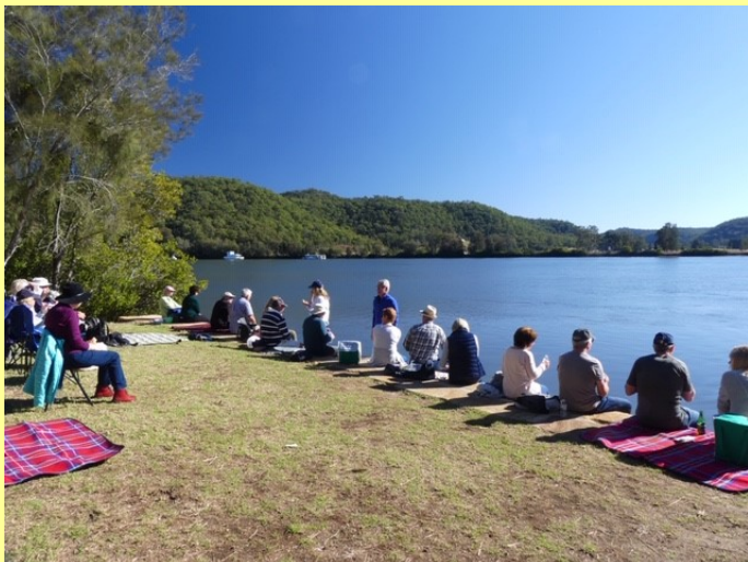
Lunch on the bank of the Hawkesbury River