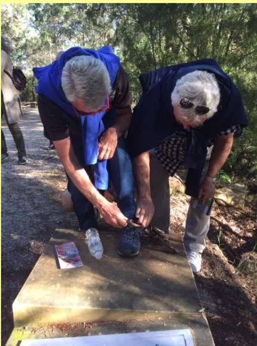
Trying on leg irons – for size!