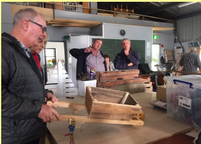
Barrow-full of laughs at the Men's Shed