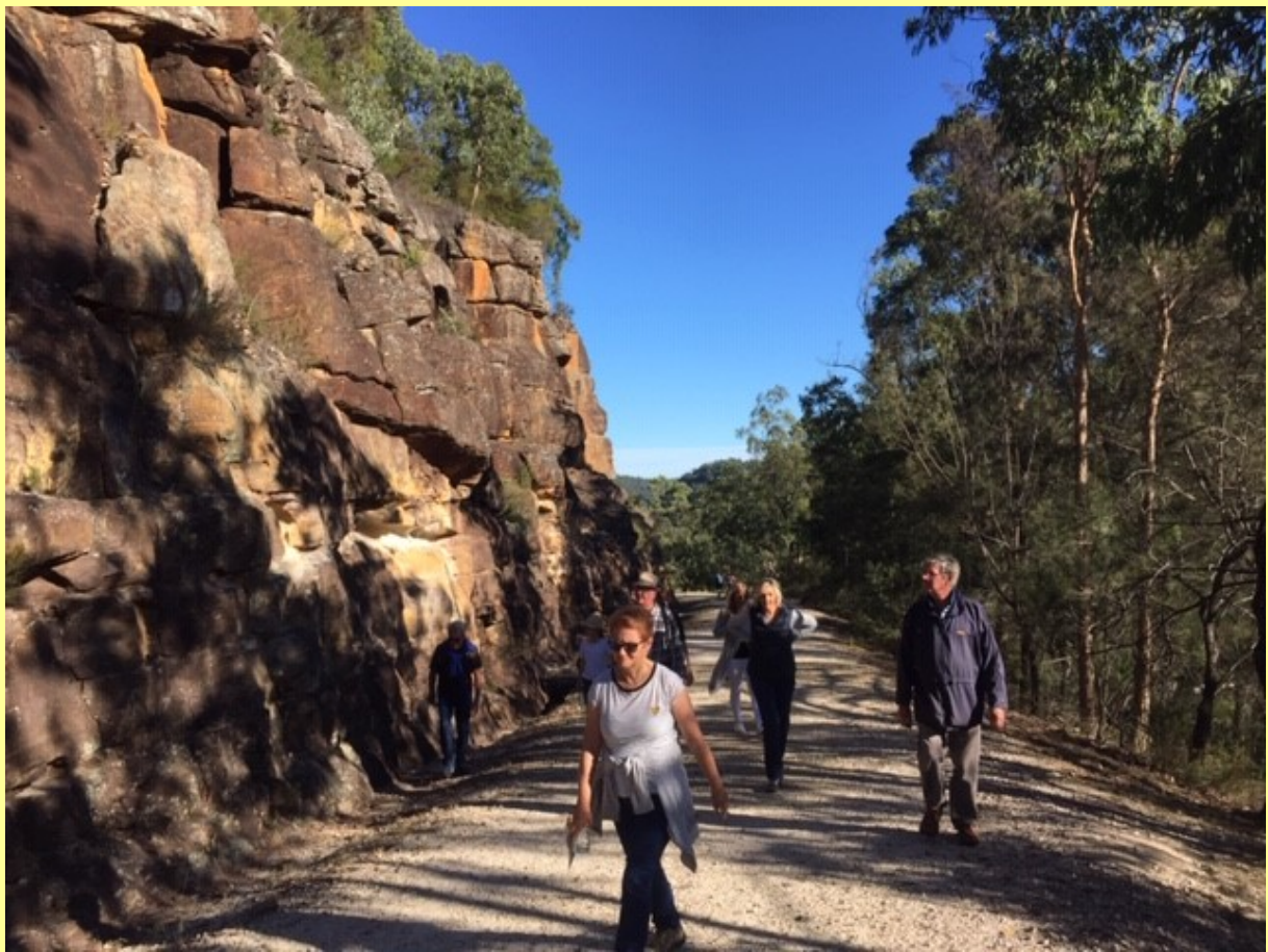
Walking Devine's Hill